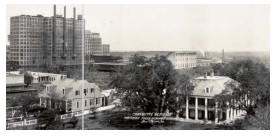
Left: American Sugar Refinery and Three Oaks, 1913.

At the same time, a half-mile upriver, a very different situation was playing out toward a similar end. It involved the magnificent Three Oaks mansion, built around 1831 for Sylvain Peyroux, a Creole sugar cane planter and French wine importer. As one of the largest homes below New Orleans, Three Oaks would become a local landmark, distinguished by its towering pearl-white Doric columns and prominent hip roof.